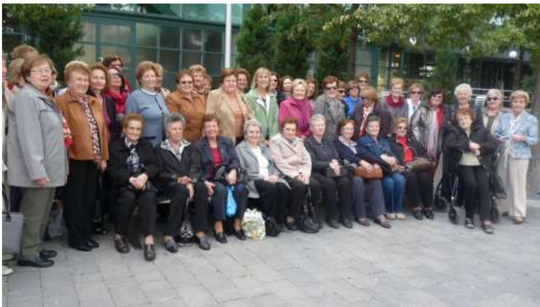
for a moment, the Women's Group almost all together