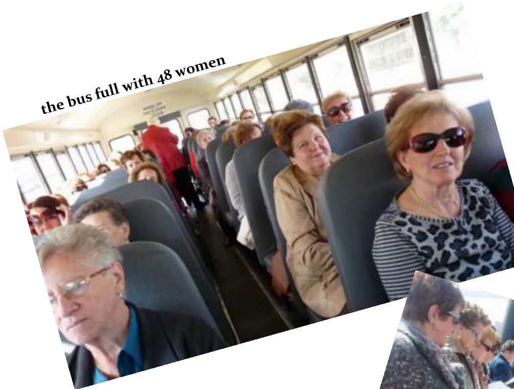
the bus full with 48 women